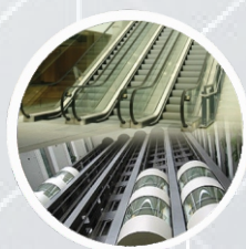
Lift & Escalators